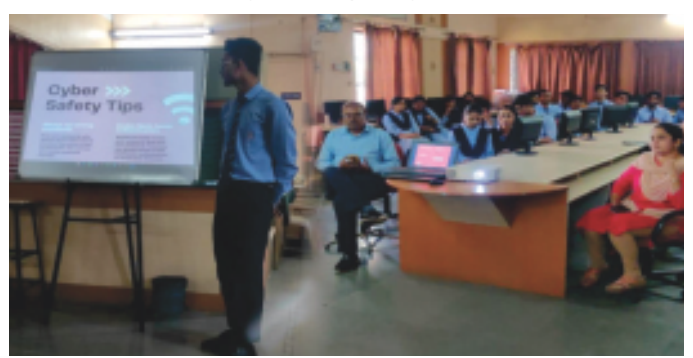
Awareness program on Cyber Security