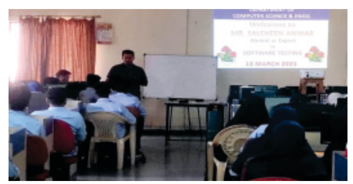
Workshop on Software Testing