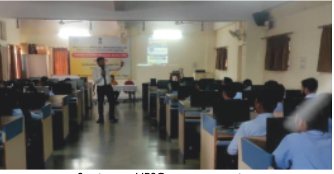
Seminar on UPSC exam preparation