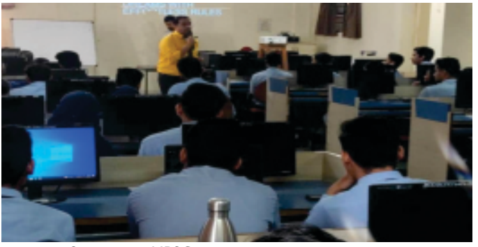
Seminar on UPSC competitive exam preparation