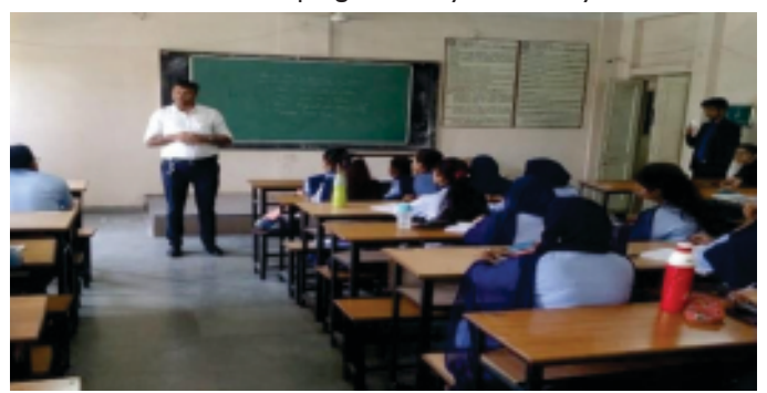
Seminar on How to Pursue Carrier in IT Sector