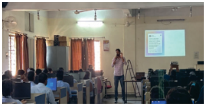
Introduction to DevOps by an Alumni