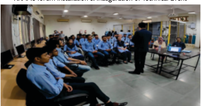
Local tour at Cloud and Robotics Department, RTMNU, Nagpur