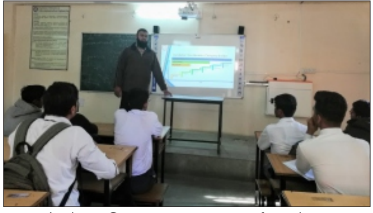
Incubation Center awairness programe for students