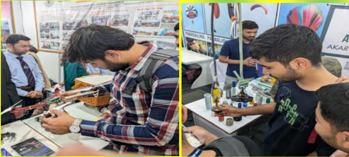
Display of Projects by final year Students of E&TC Branch