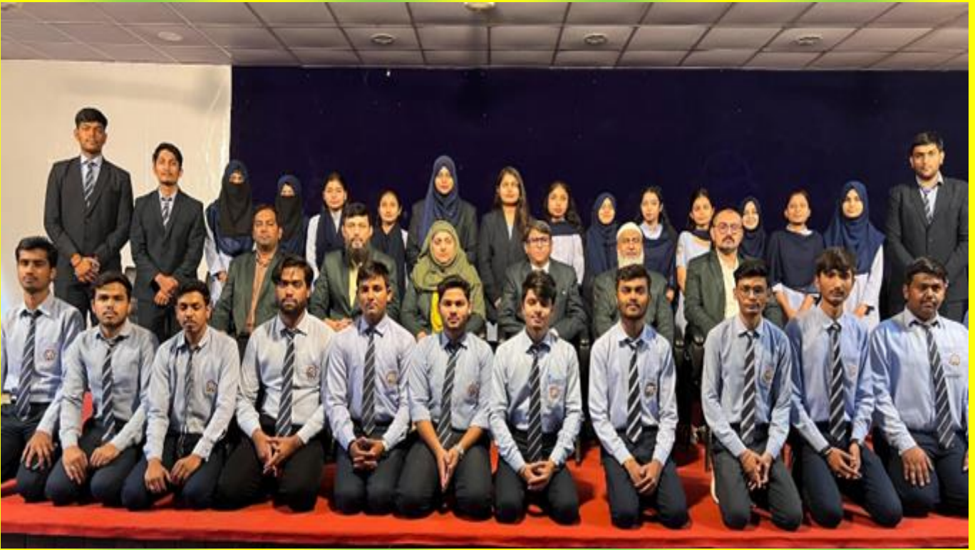
Third Year Batch Session 2024-2025