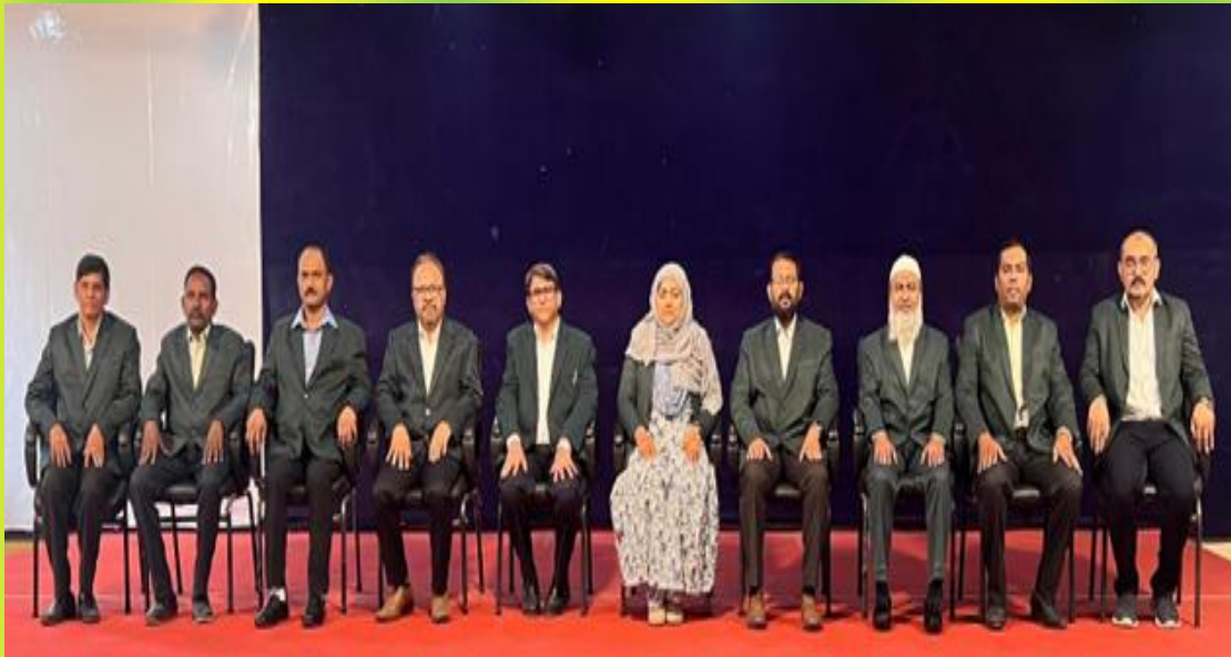
Teaching Staff of Electronics and Telecommunication Engg. Department with Principal