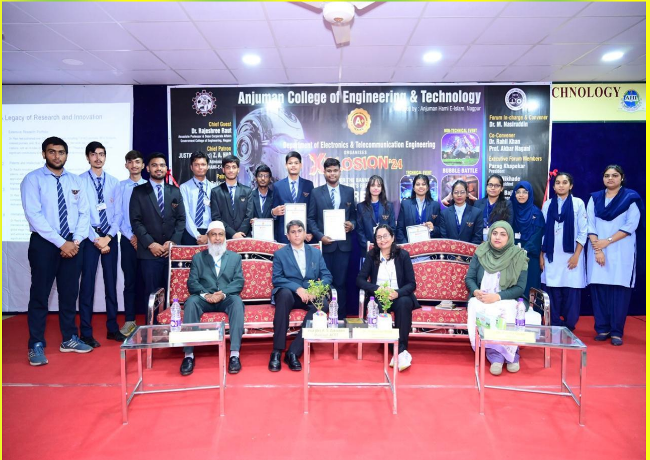
Spectron Club office Bearers 2024-25