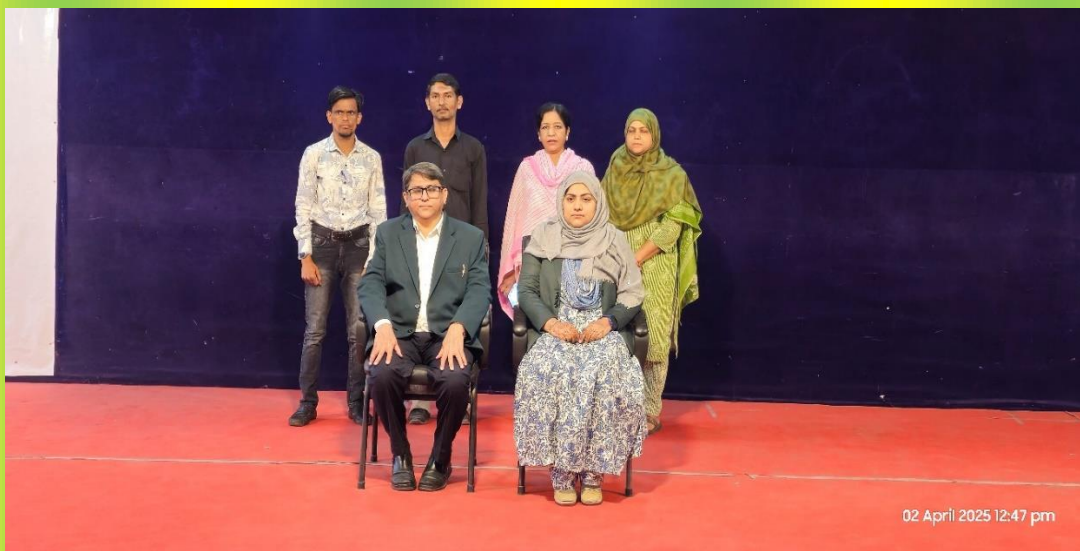
Non-Teaching Staff of Electronics and Telecommunication Engg. Department with Principal