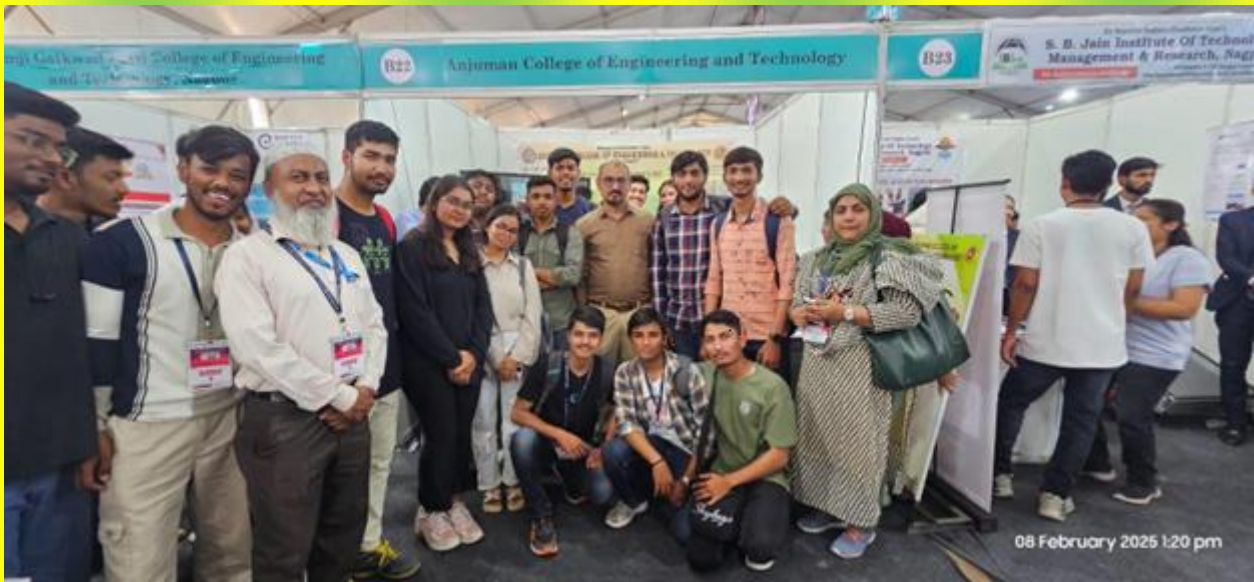
Faculty and Students E& TC Department at Advantage Vidarbha Expo 2025