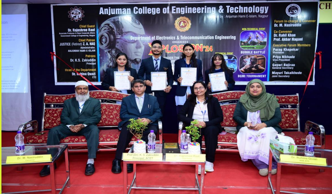
X-STREAM office Bearers 2024-25