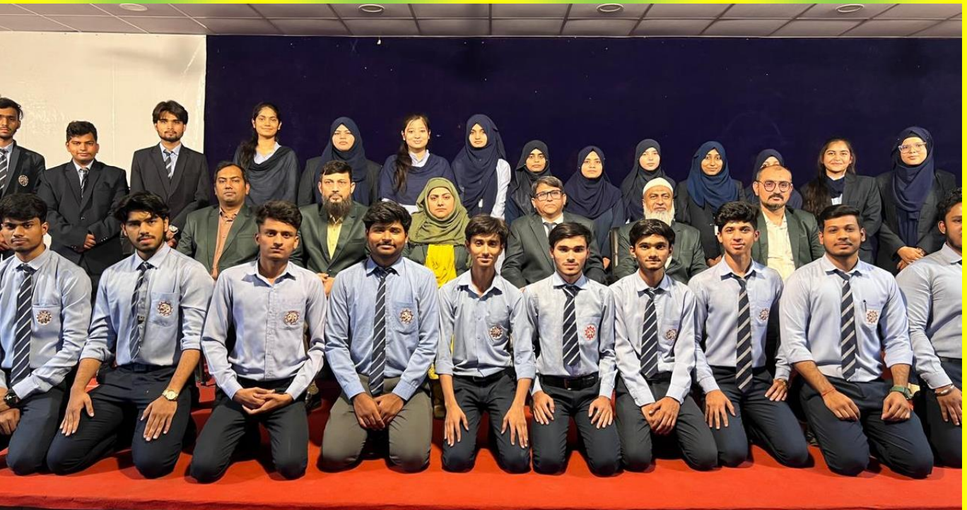
Second Year Batch Session 2024-2025