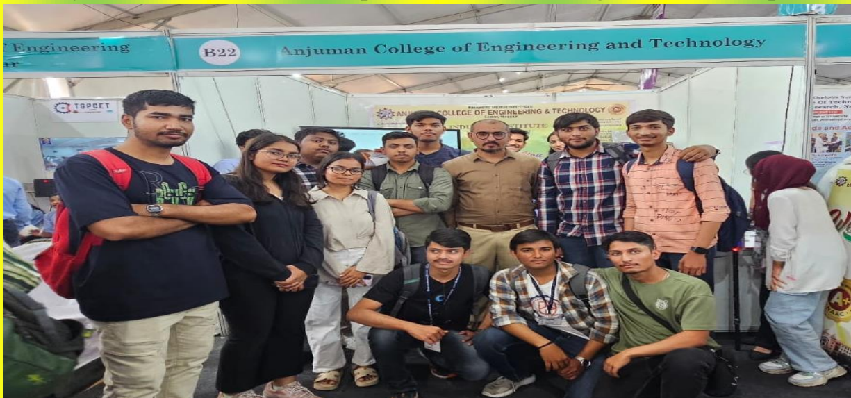
Visit of MENTOR - Mentee to Advantage Vidarbha Expo 2025