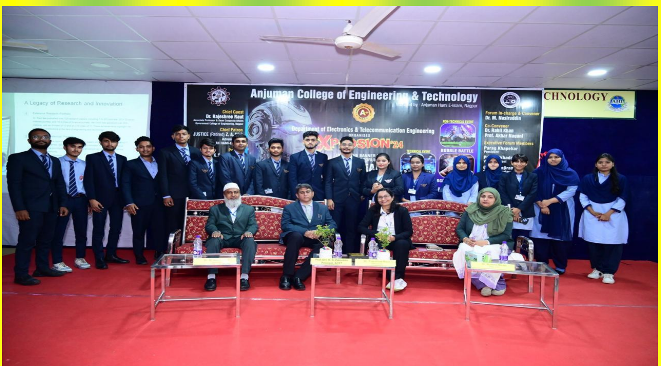
Sports Club office Bearers 2024-25