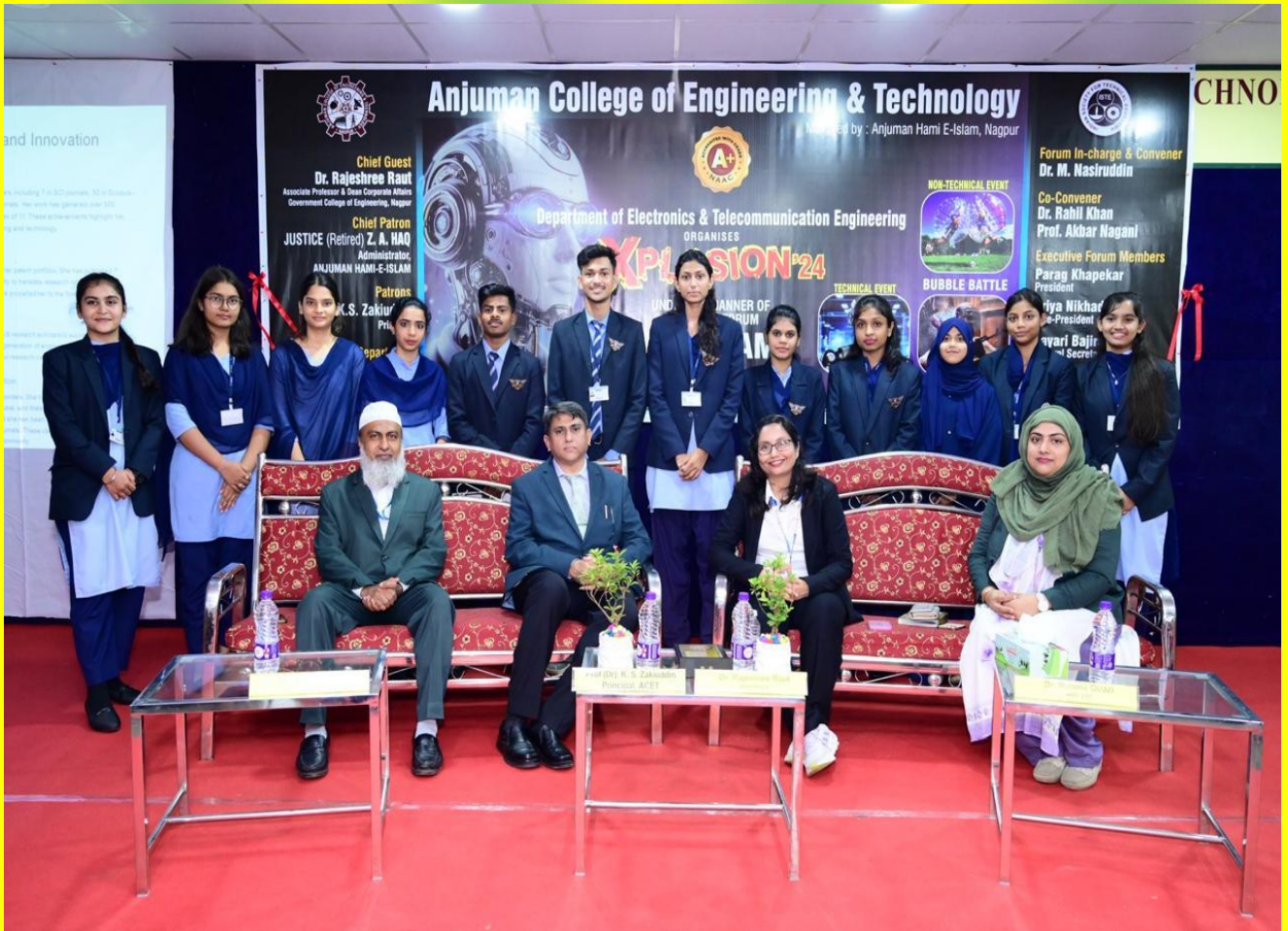
Hangout Club office Bearers 2024-25